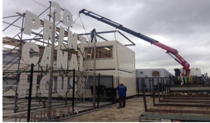
Fig 3: 3D printed canal house [17]