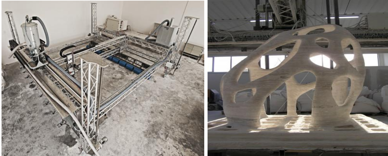
(a) Fully assembled D-Shape 3D printer