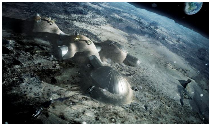
(b) Lunar base construction [28]