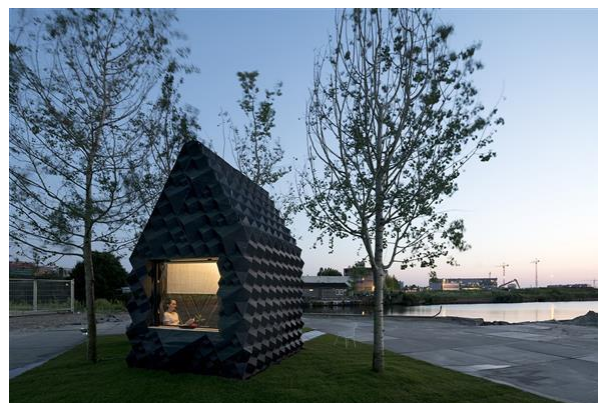
(b) 3D printed urban cabin