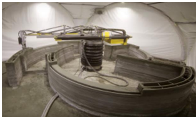
Fig 1: Contour Crafting process of Apis Cor house [14]

Numerous engineers expect a great future for 3D printing in construction and some industry experts believe that such technologies may trigger a new industrial revolution. Overall, potential advantages of 3D concrete printing include faster construction, lower labor costs, increased complexity and accuracy, greater integration of function, and use of recycled materials thereby producing less waste. This paper presents recent trends and some of research and development efforts in 3D concrete printing including its applications in extraterrestrial environment.