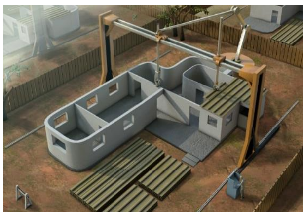
(a) Contour Crafting 3D printer

Similar to the D-shape printing, a recent study in architectural field demonstrated a 3D printing technique that used fiber reinforced cement mix with small size aggregates to improve workability of the mix [23,24]. Two different types of binders were used in this study. One was alcohol-based, water-soluble polymer and high adhesive, which was primarily used to make the mix denser and improves the curing process and flexural strength. The second was hybrid concrete polymer used to provide additional strength.