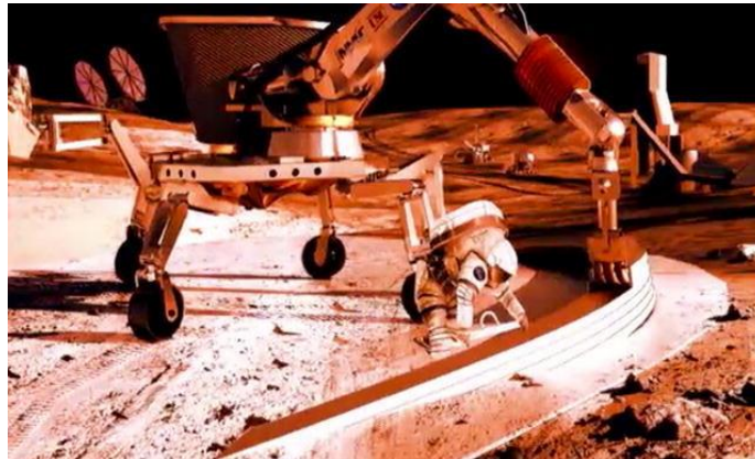
(a) Construction on Mars using 3D printer [27]